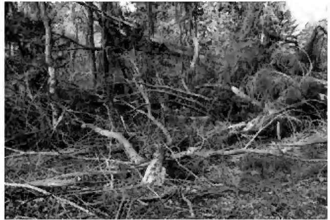
Figure 3. Portions of Muttontown Preserve were left with branches and rubble of downed pine trees. [L.Lindberg]

"Research?" "Fact?"—Preserves that had gone begging for routine trail maintenance for years, suddenly received so much more attention than necessary in the name of public safety, including sections that were well away from hiking trails or visitor use. Cutbacks in personnel and essential equipment have left the County's preserve system depleted of any biologists, naturalists, or preserve managers. The current administration may have been unaware of regulations such as the NYS Freshwater Wetlands Act that protect some of the County's preserves, and no full-time Museum staff were on-site to direct the workers. The concerns of environmental groups were often met with jeers of "What do you know about this? Are you a trained arborist?" But recommendations to consult with natural science profes-